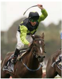
Probably another famous creature