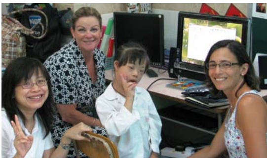
Caritas School... received MOP25,940 from ILCM to purchase three computers.