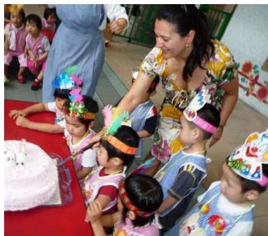
The little children... at Missionaries of Charity wait patiently while an ILCM volunteer cuts their birthday cake.