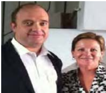
ARTM's Treatment Center... for women with drug addiction.

ILCM funded MOP50,000 for set up costs and MOP9,000 monthly to help cover operating costs for the year.