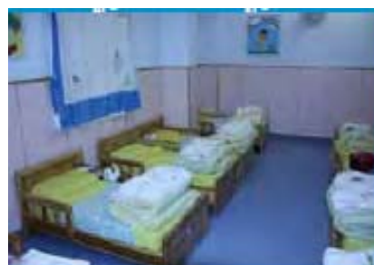
Tiny beds... for the children's dormitory at Cradle of Hope were donated by ILCM.