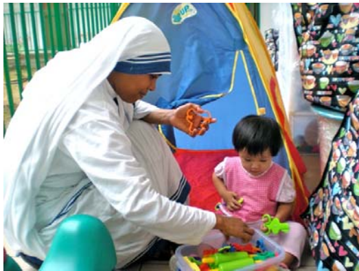
ILCM Mums & Tots... donated new toys to the children at Missionaries of Charity, and the toys were delivered by World Freight.