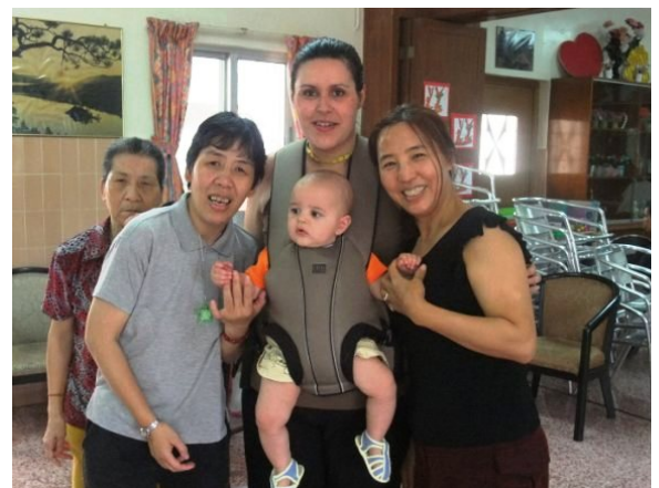
Dancing with Old Ladies... A group of volunteers and a baby dance with the ladies in Coloane on Tuesdays and it is truly great fun.