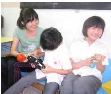
Music therapy... music therapist's fees of MOP57,000 at Caritas School were paid by ILCM.